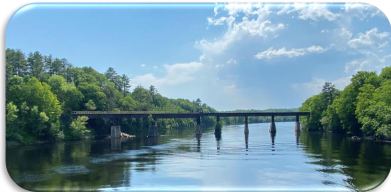
NORRIDGEWOCK CROSSING • The trestle over the Kennebec River in Norridgewock is seen above in mid-June 2023. The State of Maine is spending nearly $535,000 on upgrades to trestle crossings in Norridgewock, Madison, and Anson.

If you want to get more involved with the trails, please get in touch with the Norridgewock Sportsmen Association. ♦