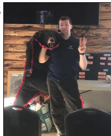
MAMMALS• A Chewonki teacher talks about bears during a recent presentation for Lakes Environmental Association

In 2018, Owls of Maine was presented and later Predators ; both were a great success. Surely this NEW presentation on Mammals of Maine will be exciting for folks of all ages! ♦