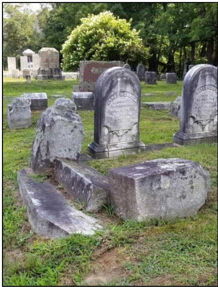
OLD CEMETERY STONES• Just a sampling of damage and wear to stones at Riverview Cemetery. Riverview Cemetery is located on Upper Main Street and hosts approximately 1,800 burials.