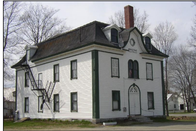
GRANGE IMPROVEMENTS • Somerset Grange #18 is pictured above, approximately 20 years ago. Significant improvements to the building's exterior will be completed soon, with the support of ARPA funds.

For your information, details about the Grange proposal for façade improvements is included later in the newsletter. Additional proposals are welcome and should be submitted to the Select Board through the Town Manager. Those wishing to propose projects may do so by emailing townmanager@townofnorridgewock.com . . ♦