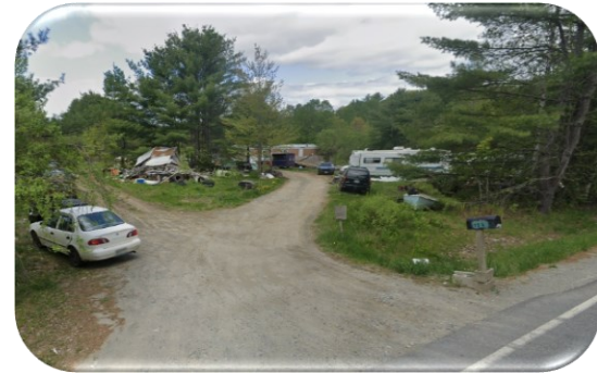
Above left is a property as seen on Google Maps in September 2011; on the right is the same property in May 2023. Below is an aerial view of the same property.

It's not that junkyards and automobile graveyards are illegal, it is that they are regulated and must be properly permitted. Unfortunately, unlicensed and unregulated junkyards and automobile graveyards plague many communities in Maine. These types of land use violations unnecessarily consume municipal resources and may cause property owners to face monetary penalties. Unaddressed, the Town can proceed with cleaning up a property and placing a lien against it.