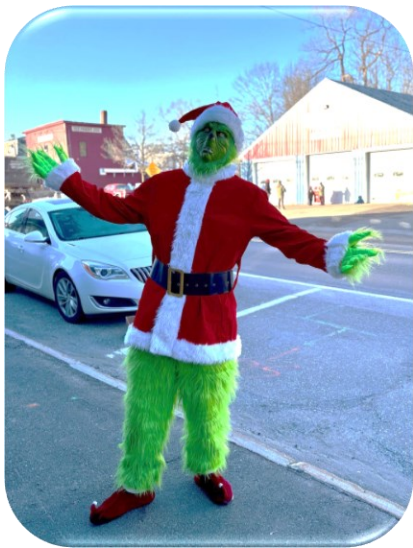
YOU'RE A MEAN ONE, MR. GRINCH – The Grinch quickly became a popular visitor to Norridgewock during the annual stroll.

It was a wonderful community event., and we look forward to it once again next year. The stroll and tree lighting is scheduled for the second Saturday in December. ♦